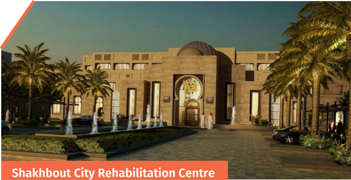
Shakhbout City Rehabilitation Centre