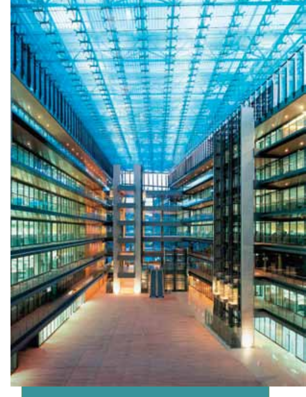
Spanish energy giant, Endesa, fills its Madrid headquarters atrium with daylight using an energy-efficient, ventilated glass roof made with DuPont™ SentryGlas®.

The technical data contained herein are guides to the use of DuPont materials. The advice contained herein is based upon tests and information believed to be reliable, but users should not rely upon it absolutely for specific applications because performance properties will vary with processing conditions. It is given and accepted at user's risk and confirmation of its validity and suitability in particular cases should be obtained independently. The DuPont Company makes no guarantees of results and assumes no obligations or liability in connection with its advice. This publication is not to be taken as a license to operate under, or recommendation to infringe, any patents.